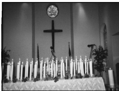
Memorial Service Candles – honoring those members who had died since the previous convention.

The Secretary's Report stated that in 2006 there were 638 members and in 2008 a total of 538, a total loss of membership of 70. Fifty-six of these passed away during that period. The Taylor local had the largest membership of 60, and the Fayetteville local, which joined the Union in 2006, had reported an increase of 12 members, and a total increase to 22 members since joining.