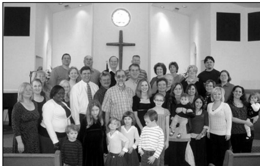
Participants at the 2008 Retreat

Join us for the 3rd annual denomination-wide choral retreat! Spend the weekend rehearsing new liturgical music while sharing your talents with other members of the denomination and followers of Christ. Workshops, rehearsal times, fellowship time, and a concert will be the highlights of the weekend. Registration forms are available at your church office, or you can