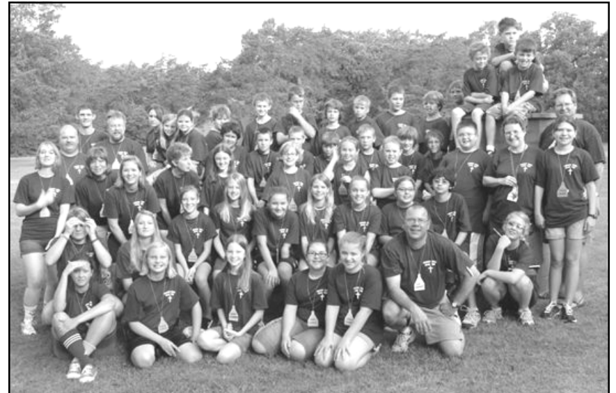
2008 Pioneer Conference