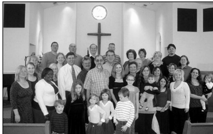
Participants at the 2008 Retreat