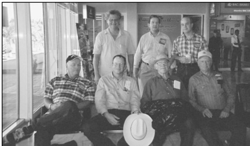
2009 Work Crew

During January 16th thru the 29th, 2009; seven Brethren from Texas traveled south of the largest tropical rain forest to the Moravian Missions Hospital, on the Patuca River at Ahuas, Honduras, to put into practice that “unity” with our southerly brethren. We did this the way Texans do this; kind of a bold hand shake, a big smile, a friendly “howdy” and what I think Texans do best, a helping hand. We started our busy days with a devotional, scripture, and prayer, then on to breakfast with the doctors at 7:00,