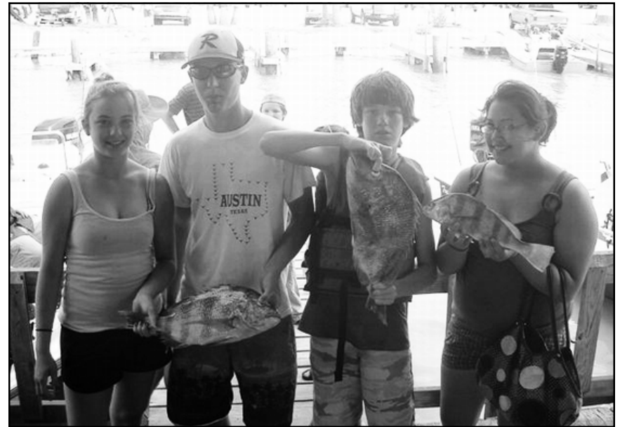
Some of the youth who enjoyed the Annual Fishing Retreat in May. (more pictures inside)