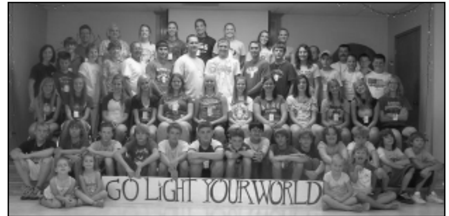
2009 Discovery Camp Participants