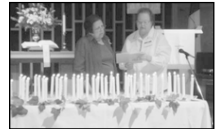
Candle Memorial for the Christian Sisters Members who have died since the last convention

The next convention of this organization in 2012 will be at the Snook Brethren Church.