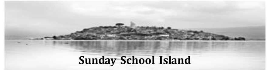
Sunday School Island

This month will focus on the Parable of the Wise Man and the Foolish Man. This parable is found in Matthew 7:24-29.