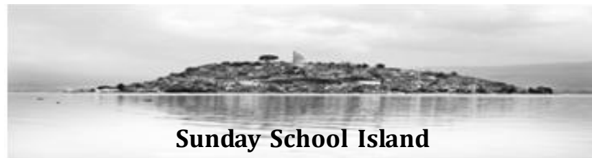
Sunday School Island

This month will focus on the Parable of the Mustard Seed . This parable is found in the Bible in Matthew 17:20-21 and Mark 11: 22-24.