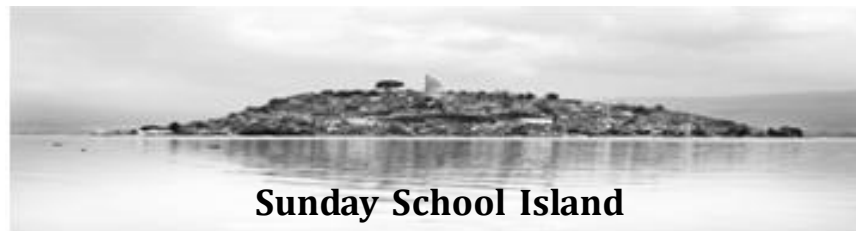
Sunday School Island