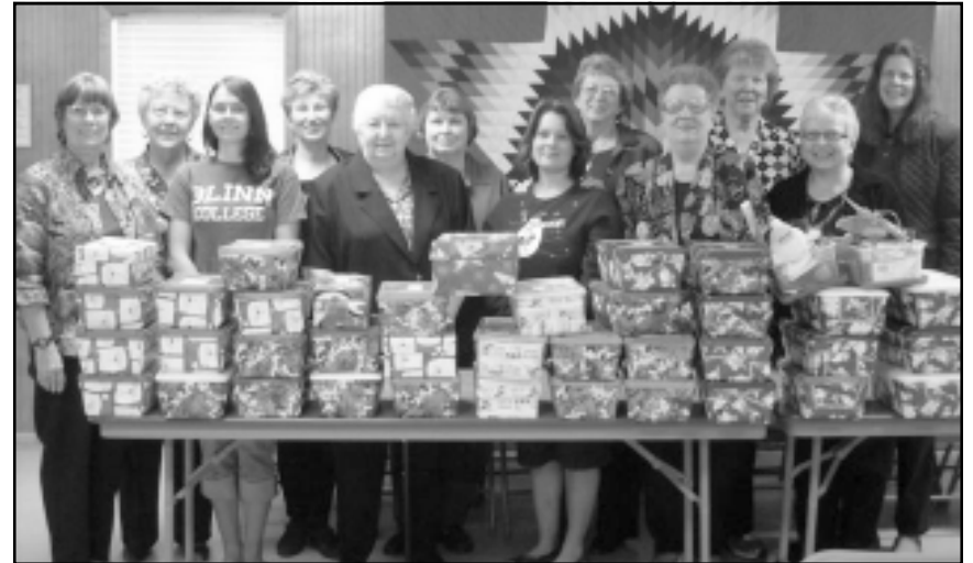
Fayetteville Christian Sisters . . . Operation Christmas Child (story inside)