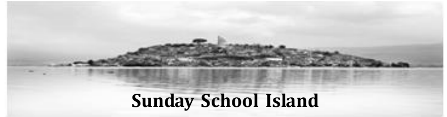
Sunday School Island