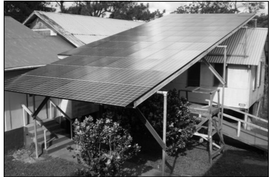
Solar Panels Installation Complete at Ahuas