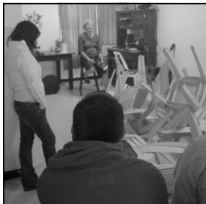
The Camino Church

I want to thank all of you, our supporters in purpose, prayer, and finances, for a good year. Without you, none of this would be possible. You have blessed us, and we trust are