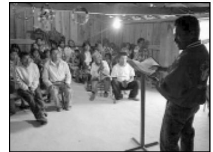
The Cochoapa Church

Last week I was in Yuvinani and got to see another unexpected thing, quite minor, really, but mentionable. The Bible translator, George, had brought a family there a couple things for their meals; boxes of apple juice and soy milk. One morning, as we waited for breakfast in the near-freezing open kitchen, Rosa served us what I thought was an oatmeal milk drink, piping hot. After the first sip, I had to stop for a bit and try to figure out why the flavor was both pleasant and rotten at the same time. I looked around, surrepti-