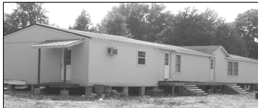
Cade Lake Chapel

With wonderful and loving support from the Unity, the first steps are being taken to make the Cade Lake Community Chapel a center for the sharing the word of Christ.