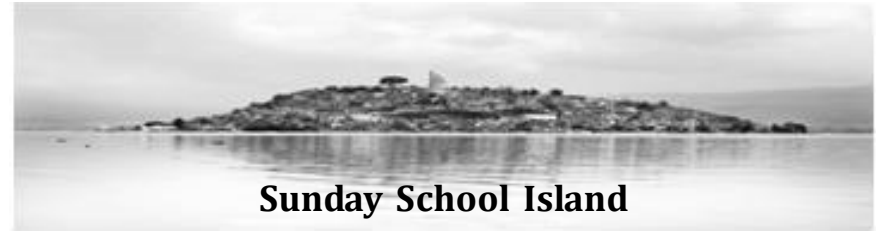
Sunday School Island

Everyday Ministries to Meet Everyday Needs A Home Mission Work to Cade Lake and Burleson County