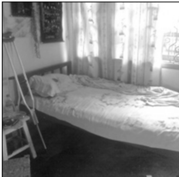
An empty bed with crutches beside it as the father is up and walking without help in the other room.