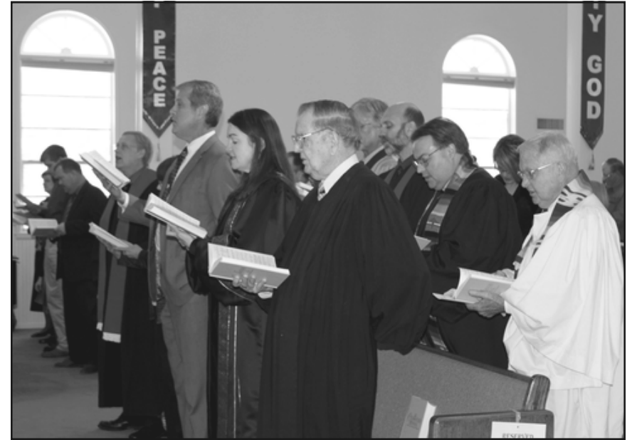
Rite of Ordination Service.