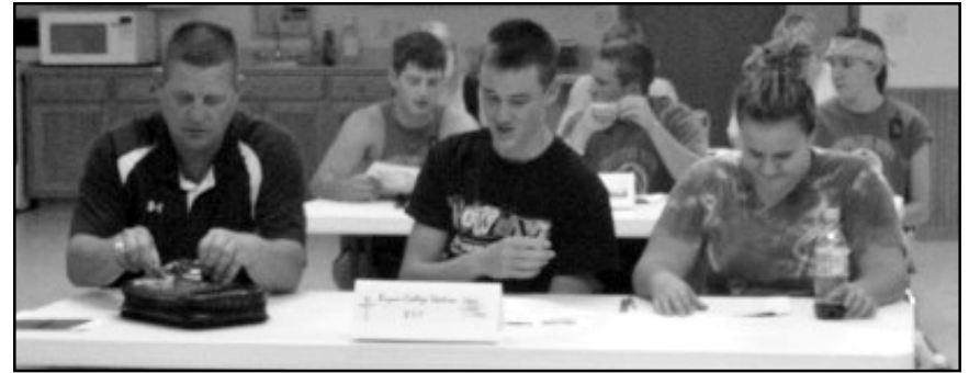
Delegates from the Bryan/College Station Church