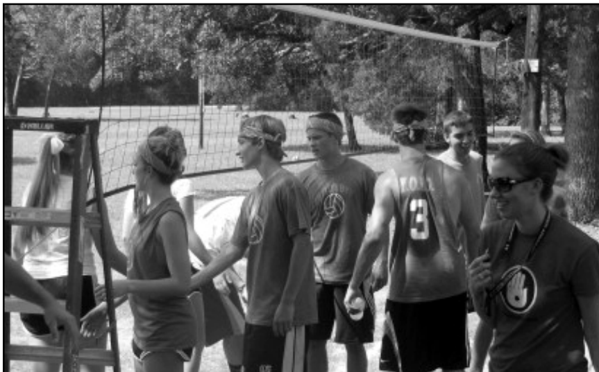
Shaking hands after a game during the tournament