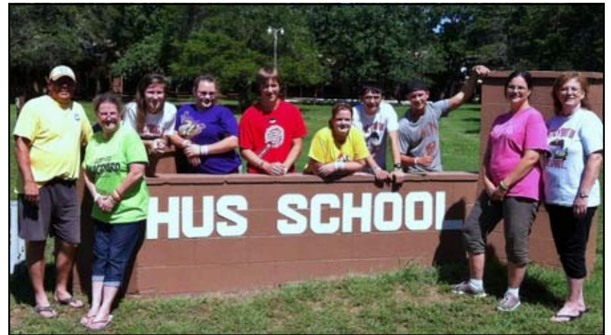
Students and staff of the 2012 Hus School (See inside front cover)