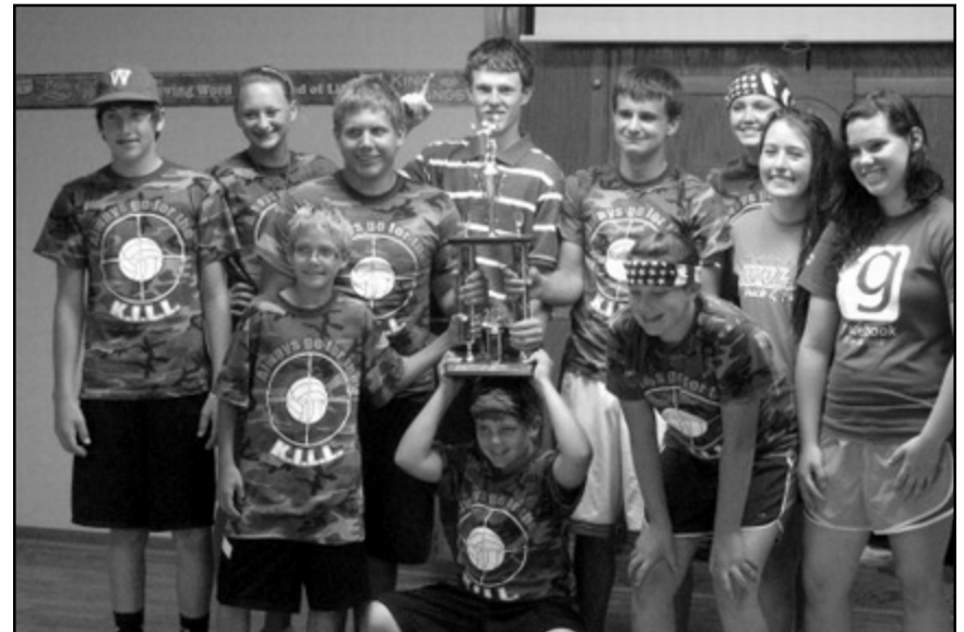
State Volleyball Champions: Wall A Team