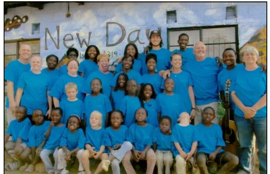
Students and Staff of the New Day Orphanage in Zambia, Africa (See inside for more on NDO)