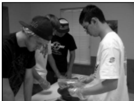
Guys making our cannon ball dessert.