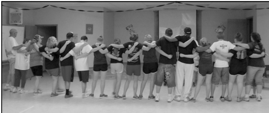
Singing during a session.