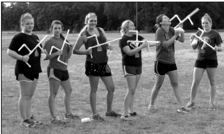
Ladies ready for marshmallow war.