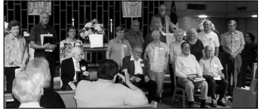
Unity Pastors recognized for their years of service in Ministry.