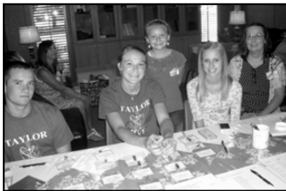
Taylor Brethren Church members manning the Delegate check-in table.