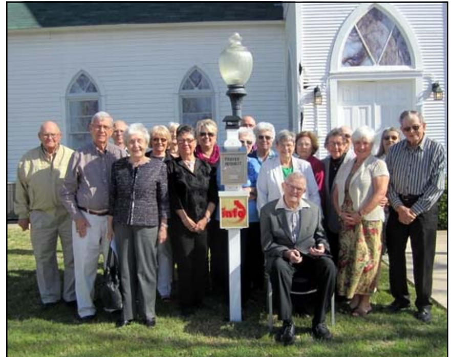
Members of the Granger Brethren Church at the installation of their Intercessory Prayer Box outside the church (see story in this issue).