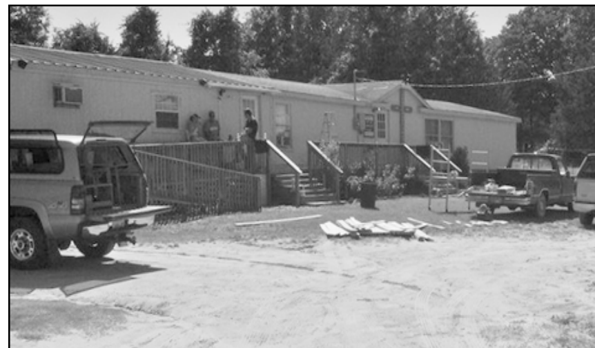
Spring Workday at Cade Lake Community Chapel