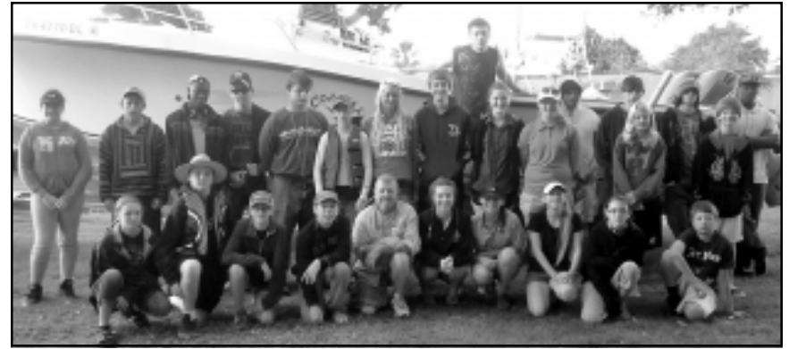
Youth that attended the Fishing retreat in Port O'Connor, Texas.