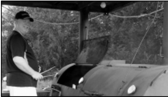
Cooking up BBQ at the Cade Lake Community Chapel Fundraiser