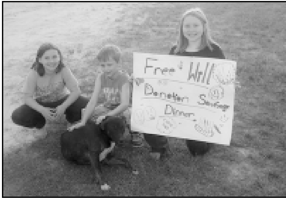
Cade Lake children advertising BBQ fundraiser