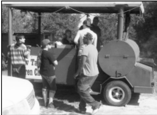
Cade Lake youth helping prepare for the BBQ fundraiser