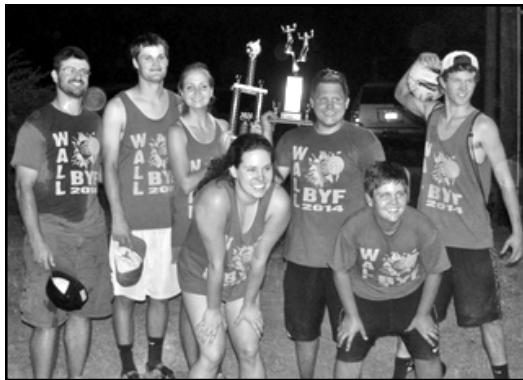
Wall Team A, 1st place.

Retreat dates for 2014-2015 are: Fall Retreat, September 13-14 (registrations due September 1); Winter Retreat, January 3-4 (registrations due December 15).