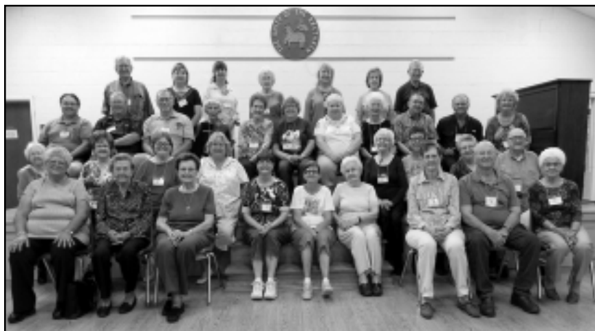
Primetimers' Retreat 2013

PRIMETIMERS is celebrating 20 years of Worship, Praise, Music, Fellowship, Study, Entertainment, and Food, and the only thing missing is, YOU!