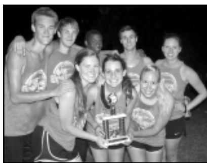
Bryan-College Station Team A, 3rd place.