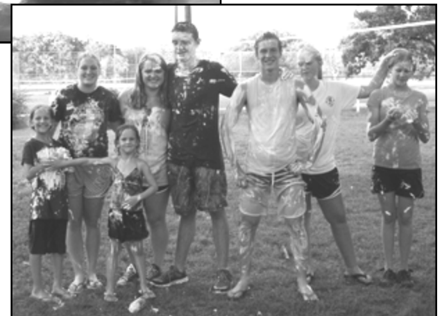
Hus students enjoying water day