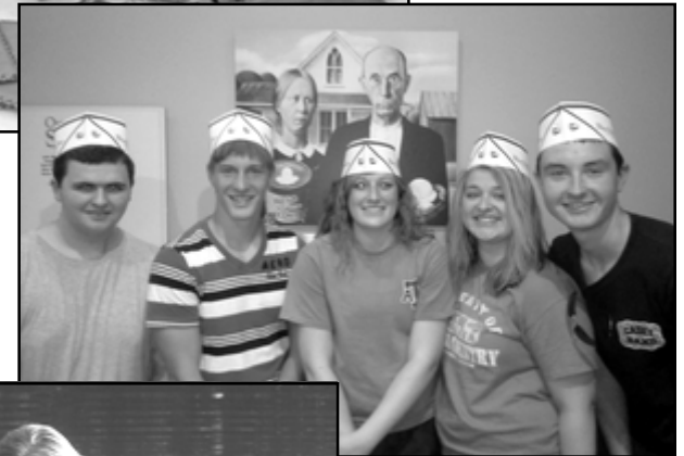
Hus students at Blue Bell Creamery.