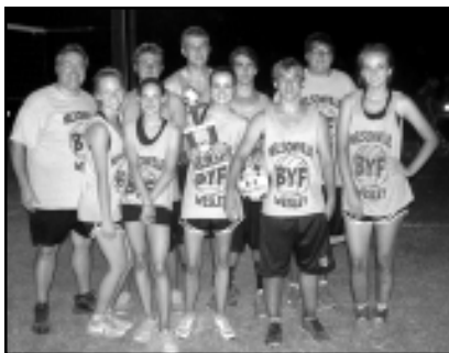
Wesley/Industry/Nelsonville (WIN) Team A, 2nd place.