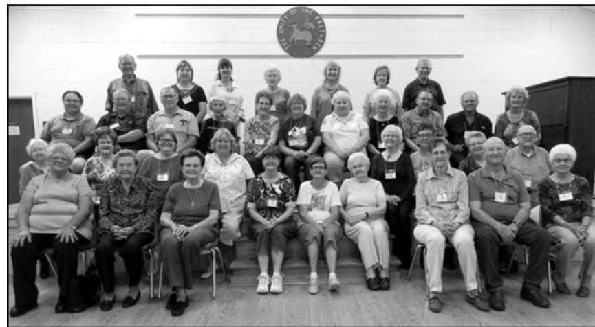
Primetimers' Retreat 2013

Primetimers is celebrating 20 years of Worship, Praise, Music, Fellowship, Study, Entertainment and Food, and the only thing missing is, YOU!