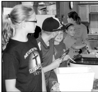
The food servers.

Saturday, September 20th, brought folks from all over the Unity together at the Ocker Brethren Church to enjoy fried fish, beans, coleslaw, potato salad, hushpuppies, desserts, and tea. And – if the food wasn't blessing enough – fish tales and fellowship flourished.