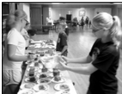
The desert servers.