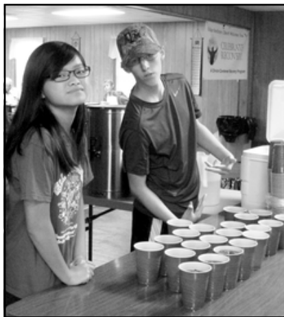
The tea servers.

Thank you to everyone who helped with meal contributions and preparation, monetary donations, and through prayer for this endeavor. All proceeds will be used for the State Youth fishing retreat in May.