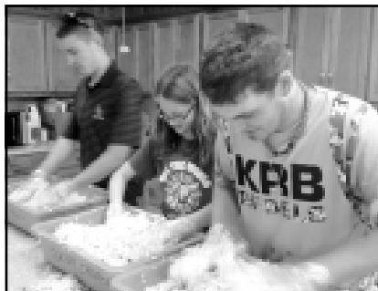
The coleslaw mixers.