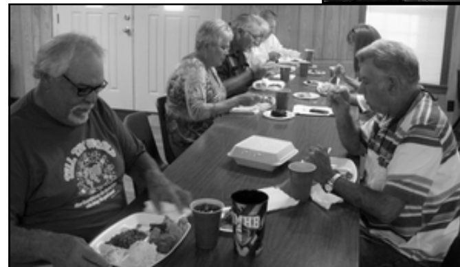
The satisfied customers.