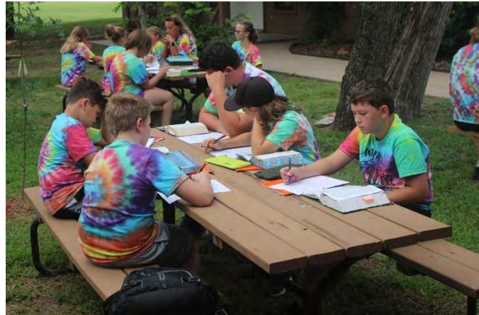
Alpha Camp 2020

The Hus School Encampment continues to serve its intended mission of providing a Christian setting where people of all ages can gather and experience God’s Kingdom. This has been the fundamental mission of the Hus School Encampment since its inception some 60 years ago. Over that period the Camp has touched the lives of thousands. As I write this report on June 20, the Hus School Class of 2021 is beginning its two-week program today which will be followed by Encounter, Discovery, Alpha and Pioneer Camps ending in late July. Following is a summary of the activities at the Encampment since the previous Unity Convention in 2019.