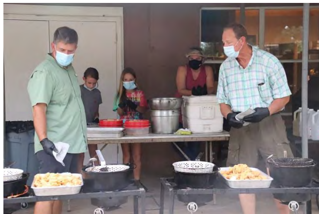
Masks required during meal preparation