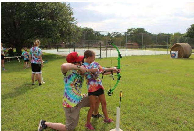
Archery Course at Alpha 2020

During its 2019 session, the Texas Legislature changed its definition of a youth camp for purposes of licensing, oversight and inspection. The camps offered at the Hus School Encampment no longer