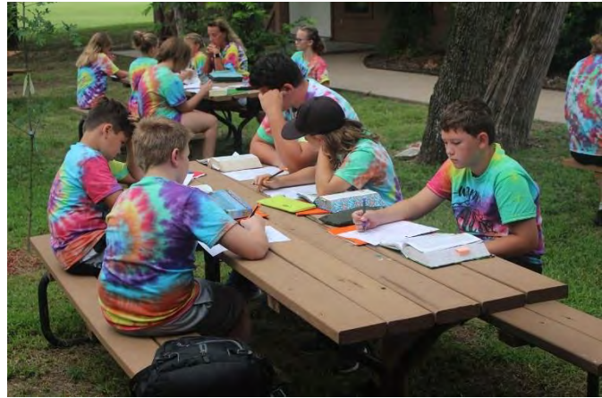
Alpha Camp 2020

The Hus School Encampment continues to serve its intended mission of providing a Christian setting where people of all ages can gather and experience God’s Kingdom. This has been the fundamental mission of the Hus School Encampment since its inception some 60 years ago. Over that period the Camp has touched the lives of thousands. As I write this report on June 20, the Hus School Class of 2021 is beginning its two-week program today which will be followed by Encounter, Discovery, Alpha and Pioneer Camps ending in late July. Following is a summary of the activities at the Encampment since the previous Unity Convention in 2019.