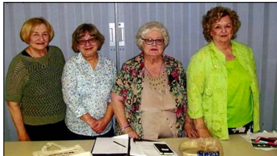
2015 Christian Sisters Officers from the Community Christian Church of Rosenberg