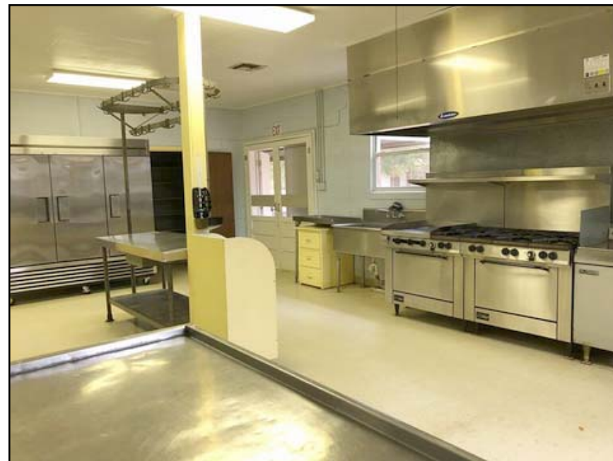
The Hus Encampment kitchen prior to the start of phase I renovation. (See story inside this issue)

POSTMASTER: Send address changes to The Brethren Journal, 705 Woodson Dr., Caldwell, TX 77836.