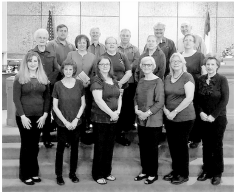
Members of the Easter Cantata honoring the Resurrection of Christ.

Members represent Caldwell, College Station, Cooks Point, New Tabor and Snook Brethren Churches as well as a couple participants from the Community.