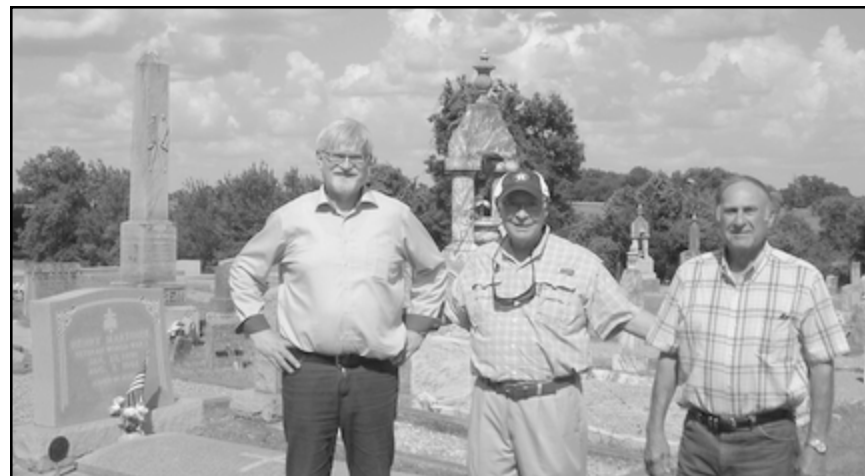
In the Fayetteville Brethren church cemetery.

Why can't we see heaven from earth? We cannot see heaven because we were created to only exist in, and understand, three dimensions. We can only understand length, width, and depth. Hold up three pencils, crossing two to denote length and width, then spearing them at the cross section to denote depth. This is all we are designed to see and understand. However, theoretical physicists, also known as string theorists, have determined that mathematically there are ten dimensions. Regular superheroes only travel in 3 dimensions. John went into the 4th, 5th, and maybe the 6th dimensions. Let me introduce you to the Flatlanders. They can only see in 2D – left and right. Lay out brown bag and face cards. Could they see us?? No. That would mean they would be seeing into the dimension of depth, and there is only length and width. So, they can't see us. Does that mean we are not here? No. John was telling people about God, but since the people could not see God, they didn't believe. They put John in jail and did many other horrible things. God decided to rescue John by pulling him out of earth and took him to Heaven. He saw angels. He saw Jesus. He saw the devil and totally bad-guy murderers thrown into the fiery pit. He saw helicopters and bombs on the earth, with angels going back and forth from heaven, helping out and doing God's will. He