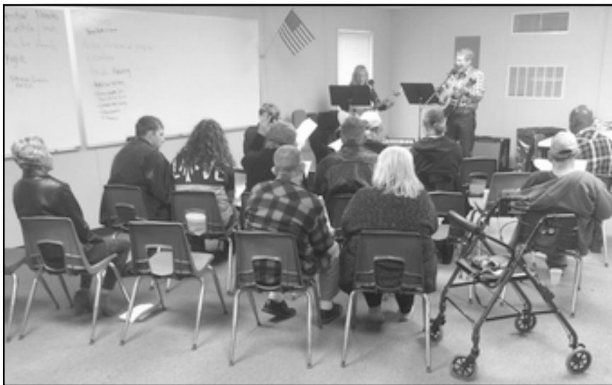
Cade Lake members gathered in the new building for their first worship service

Cade Lake Chapel's previous location. Because of rain, the process of building the pad and moving the building onto the site was delayed a few weeks. With great joy and excitement, the members saw the building moved to the previous location and secured to the pad on February 1, 2019.