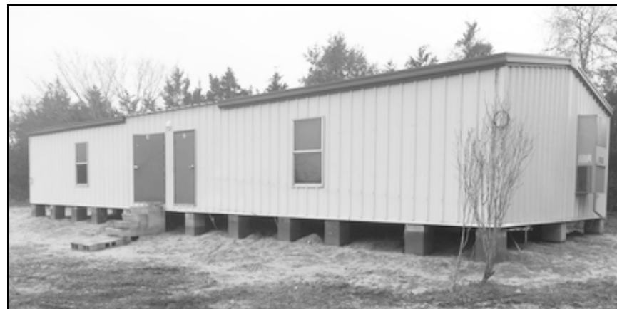
The new Cade Lake Community Chapel building.