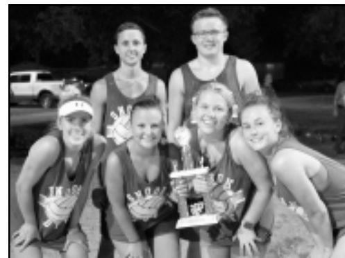
Snook Brethren: 2nd Place