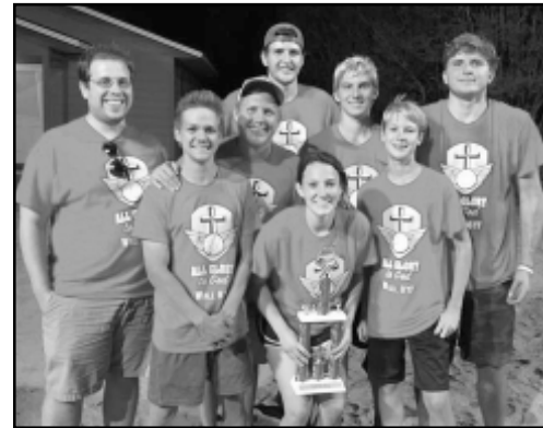
Wall Brethren: 1st Place