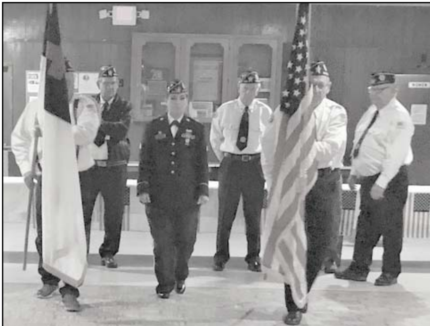
Posting of colors by American Legion members