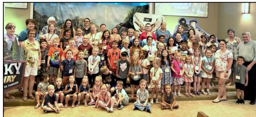
New Tabor Brethren Church Vacation Bible School 2021 “Rocky Railway”

If you wish to become a special FRIEND OF THE BRETHREN JOURNAL, please send your donation to the Business Manager (address inside front cover). These donations are tax deductible.