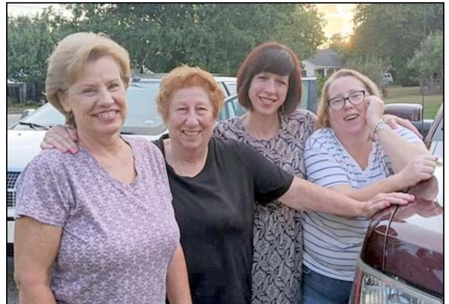
Ladies of Caldwell Brethren Church

If you wish to become a special FRIEND OF THE BRETHREN JOURNAL, please send your donation to the Business Manager (address inside front cover). These donations are tax deductible.