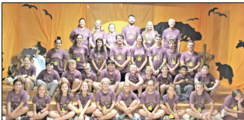
Alpha Camp 2022 (See story in this issue)